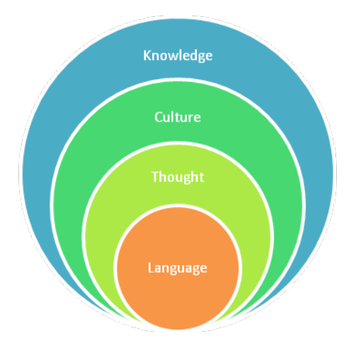
Figure 2: The evolving levels in e-business teaching.

after the class can help students to understand the language. This atmosphere is more conducive to the students quickly improving their English. In addition, students who expand their scope of reading foreign literature are inclined to have a deeper insight into professional knowledge. As well, such students are likely to have a better grasp of the language and be more flexible in its use. The levels in e-business teaching are illustrated in Figure 2.